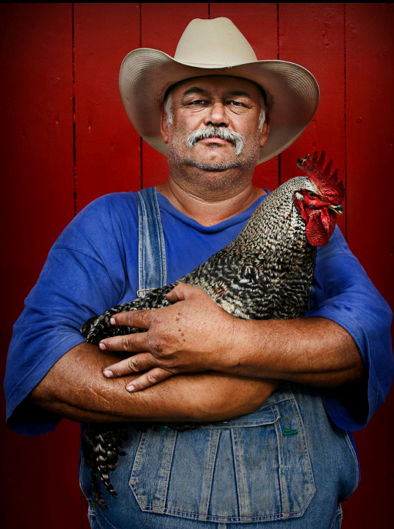
Exhibit on Display at Manitowoc Public Library Through October 20

Through forty-five photo-portraits, "American Farmer" celebrates the living spirit of our heartland through the faces and voices of the people who keep it alive.